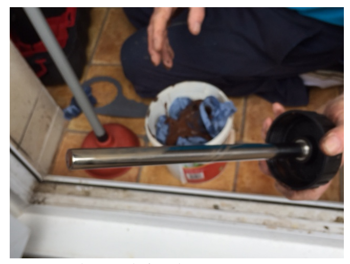
Central magnet before cleaning

Take a look at the pictures below which show the central magnet of a MagnaClean filter before and after flushing just a single radiator. These were taken by us at a Harpenden home.